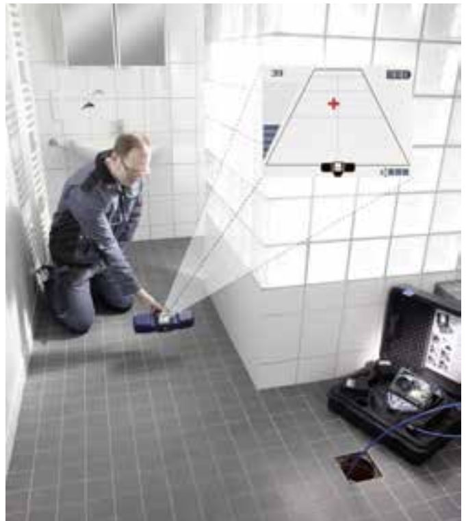
The actual meter count and the position of the head are displayed in the monitor. The Wohler L 200 Locator makes it possible to locate the camera head wirelessly.