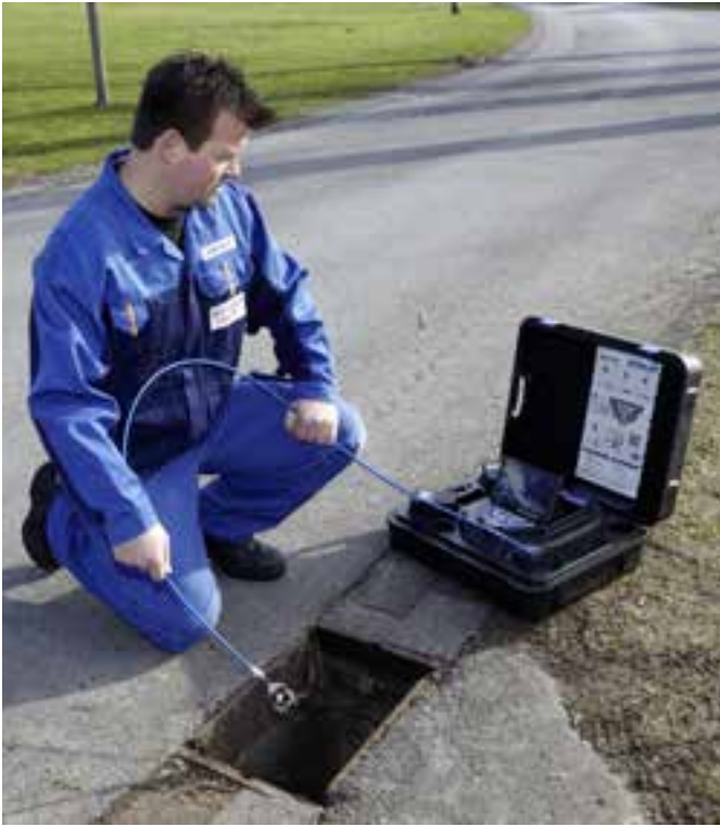
The 100 ft. push rod and the pan&tilt color camera head make sure nothing in the house supply line remains hidden from your view.