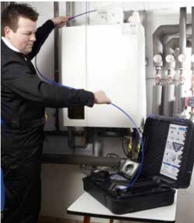
The 360° pan and 180° tiltable color camera head easily negotiates 90° bends.