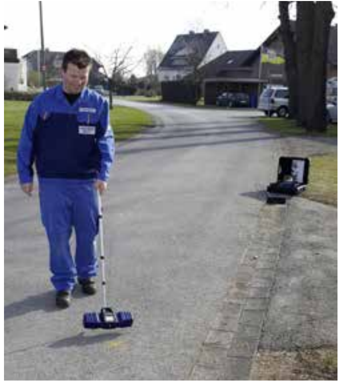
The Wohler VIS 350 precisely locates radio waves transmitted by the camera head through concrete and asphalt to save a lot of time and further building damage.