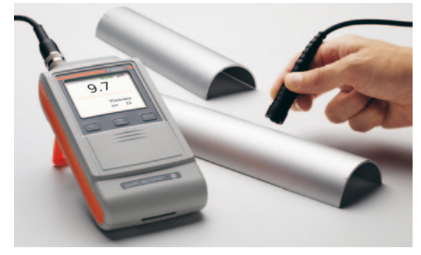
DUALSCOPE® FMP20 using the probe FTD3.3