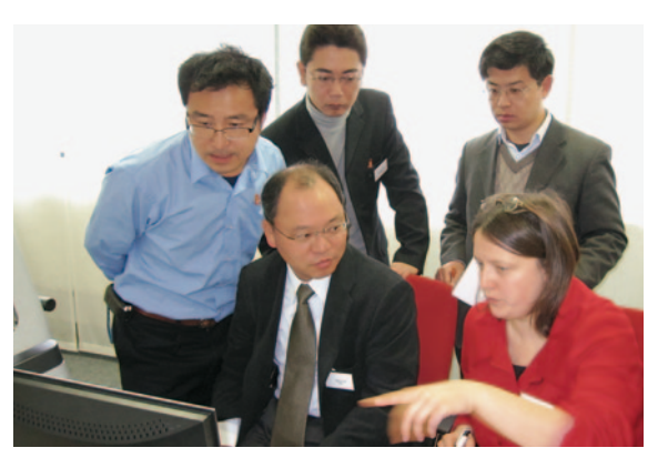
A FISCHER seminar teaches metrological basics and practical knowledge in small groups

Because we want you to receive maximum benefit from our products, FISCHER's experts are happy to share their application know-how. The seminars not only teach metrological basics but also hand-on experience in small groups to put the theory into practice.