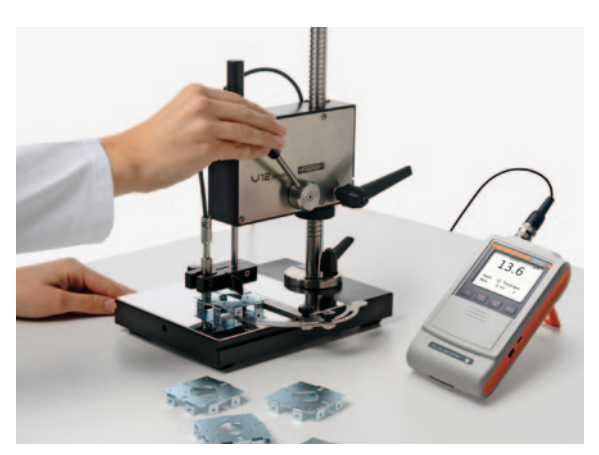
DUALSCOPE® FMP40 using the probe FGAB1.3 and support stand V12 BASE - measuring parts with position accuracy

The FMP30 and FMP40 instruments feature additional more memory for numerous customer-specific measuring applications as well as extensive graphical and statistical evaluations. Tolerance limits can be entered into the calibratable measuring applications and the production process can be analyzed statistically.