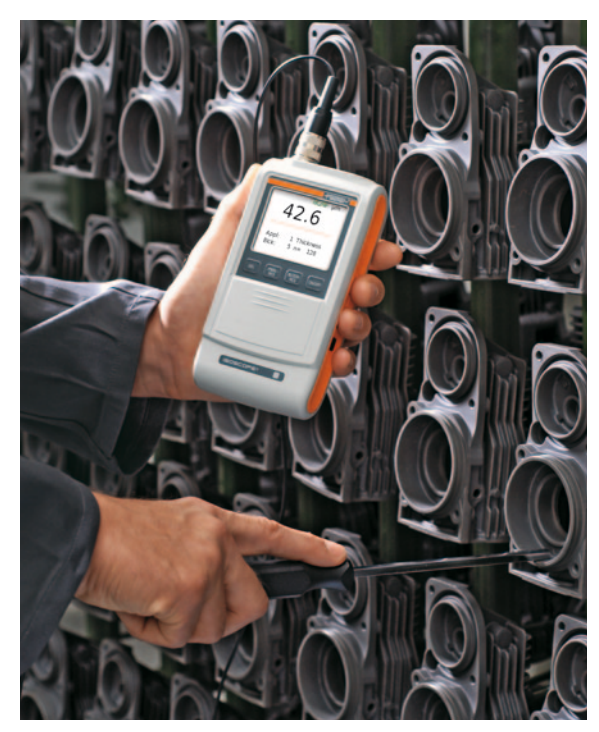
Measurements using the internal probe FAI 3.3-150