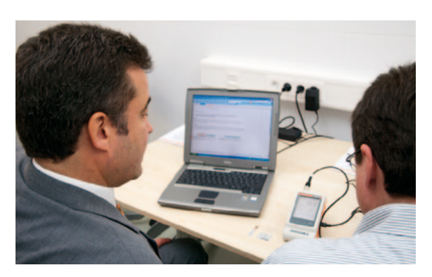
User training for the DUALSCOPE ^{\!\otimes} FMP100 on-site at the customer's

With our training program we make your employees fit on-site for your measuring task. Our trainer takes account of your individual requirements and wishes.