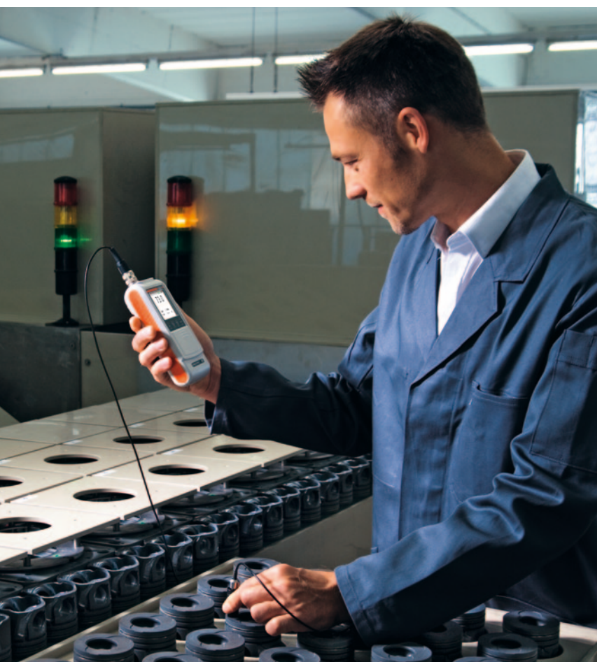
Quality monitoring on engine pistons immediately after the manufacturing process using the FTA3.3H probe

Select the appropriate instrument from the FMP family and combine it with one of our high-precision measurement probes.