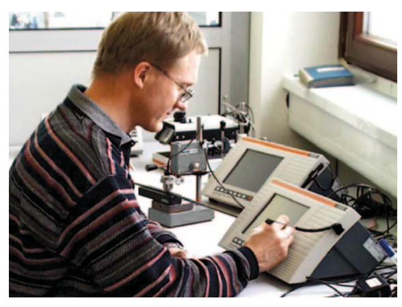
Measuring on a customer's specimen in a FISCHER application laboratory

More and more, demanding applications require highly qualified application advice. FISCHER addresses this need with its application laboratories located around the world (Germany, Switzerland, China, USA, India, Japan and Singapore).